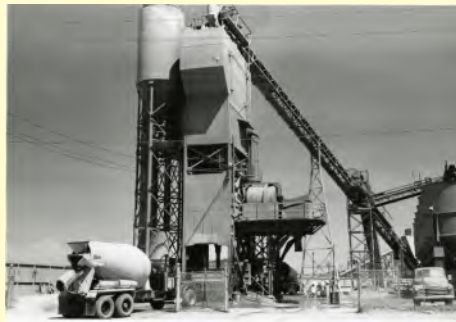
Berkeley Ready-Mix Co., concrete, 7th St., 1950