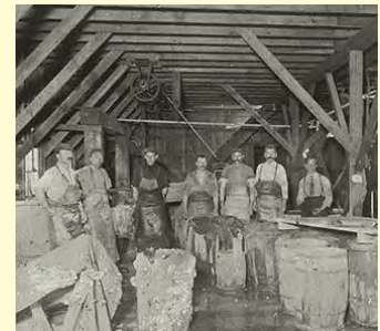
Manasse-Block Tanning Co., boot and shoe leather, 4th St., ca. 1900s