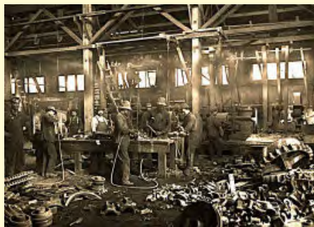
Pacific Steel Casting, 2nd St., ca. 1930s