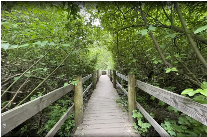
Jewel Lake loop trail and the Never-Ending Bridge.

Jewel Lake is a small man-made lake located at the Tilden Nature Area in Berkeley's Tilden Park in the East Bay hills. In 1921, the People's Water District, precursor to the East Bay Municipal Utility District (EBMUD), created a drinking-water reservoir by transporting earth from the slope above what is now known as Jewel Lake to build a dam across Wildcat Creek, a small stream in Wildcat Canyon between the Berkeley Hills and Sbrante Ridge Hills. Over time, the dam trapped large quantities of sediment, reducing the lake's depth and volume, and thus its effectiveness as a reservoir. In 1933, a year before the birth of East Bay Regional Park District (EBRPD), EBMUD transferred the reservoir to EBRPD for recreational use. The dam and abandoned flood-control machinery are visible at the north end of the lake. Jewel Lake has been dredged twice since 1921: in 1967 and 1991. According to a 2016 study by Flow West for EBRPD, "Jewel Lake has almost re-filled with sediment." EBRPD continues to assess options for improving Jewel Lake and the Wildcat Creek watershed.