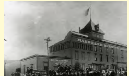
Raspiller Brewing Co., Delaware St. and San Pablo Ave., 1893