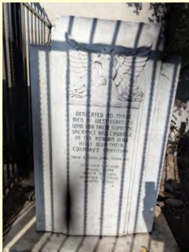
Monument outside the Veterans Memorial Building on Center St. in downtown Berkeley.

Obscured amid the sidewalk clutter and enclosed in iron fencing right outside the Berkeley Historical Society and Museum building's front door, a marble marker memorializes five young West Berkeley men who died during the Korean War. Installed in 1997, it was until recently surrounded by a small garden maintained by a BHSM volunteer. But for forty-five years before that, it stood near the places where the young men had lived: in the patio of the Mobilized