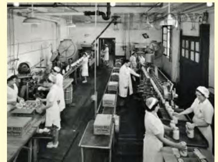
Durkee's Famous Foods, assembly line, 5th St., 1942