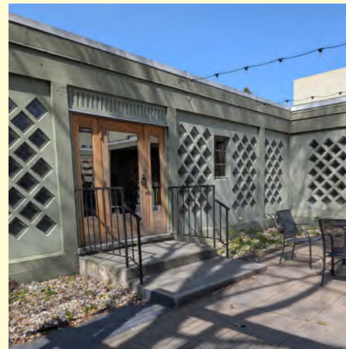
Patio of the Mobilized Women of Berkeley building. The monument was originally installed to the left of the door.