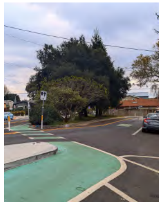
Intersection of California St. and Dwight Way, 2004 (above) and 2025 (right).

discussing whether to request that the city place a landscaped traffic island on that corner for the purpose of traffic control, safety, and neighborhood beautification.