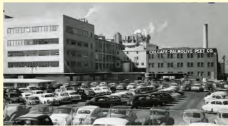
Colgate-Palmolive-Peet Co., soap and toothpaste, 7th St., ca. 1950