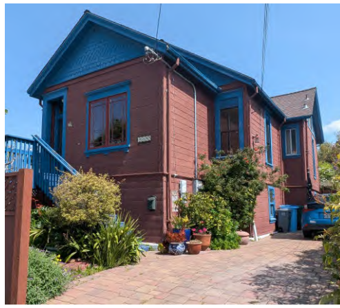
Pozos home on Eighth St.