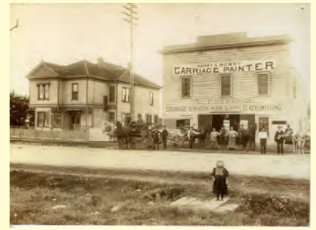
Carriage painting, wagon work, blacksmithing, Addison St. and San Pablo Ave., 1895