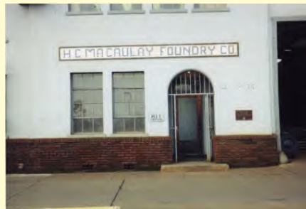
H.C. Macaulay Foundry Co., metal casting, Carlton St., closed 1937 (photo 2002)