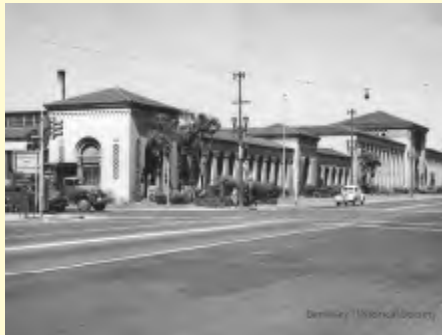
H.J. Heinz Co., food processing, San Pablo Ave., 1940