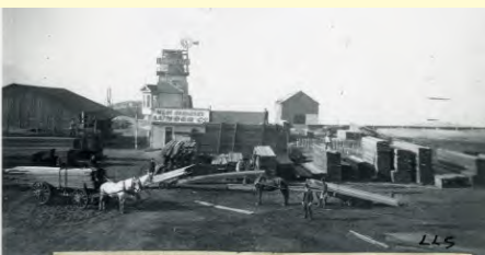
West Berkeley Lumber Co., University Ave., 1890