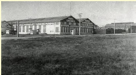
Byron Iron Works, turbine pumps, Carlton St., 1900