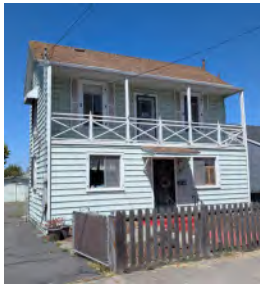
Billy Martin's childhood home on Seventh St.

Billy entered Berkeley High School in 1942. There he saw how kids from the Berkeley Hills, the “Goats,” dominated the school. Billy resented the Goats and considered them spoiled and privileged. His group of friends from the neighborhood, who used to maraud around town as the “West Berkeley Boys” (with Billy as the de facto leader), were now known as “shop boys” because of their placement in vocational classes.