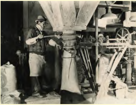
Gaviota Fertilizer, Pacific Guano Co., sack filling, 2nd and Hearst Streets, ca. 1930