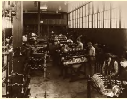
Hall-Scott Motor Car Co., airplane engine assembly, 5th and Snyder (now Heinz), 1914