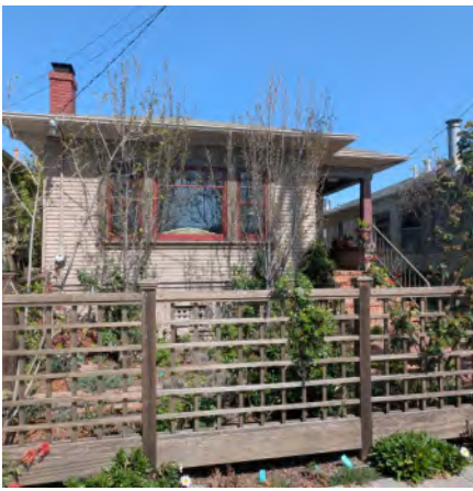
De Alba home on Virginia St.