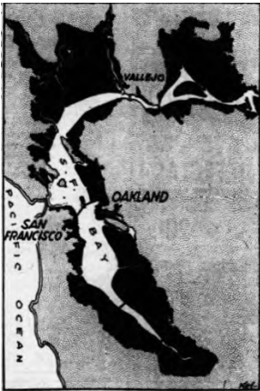
Figure 1. San Francisco Bay potential fill by 2020 (Oakland Tribune, April 23, 1961).

In 1959 the U.S. Army Corps of Engineers released a study showing the area of San Francisco Bay that might feasibly be filled in by the year 2020 (Figure 1). In that map, all that remained of the bay was a narrow shipping channel. While that was just a feasibility study, in 1961 Berkeley city government began work on a proposal to fill more than 2,000 acres of the city's waterfront, doubling the size of the city, so that the new city boundary would stretch about two miles out into the bay. But none of that took place. Today, Berkeley's waterfront contains a string of public parks and a bayfront trail for walkers and cyclists to enjoy. This didn't just happen by itself; Berkeley's Urban Care organization was central to the effort to save the waterfront from commercial development. Part 1 of this series showed how Urban Care