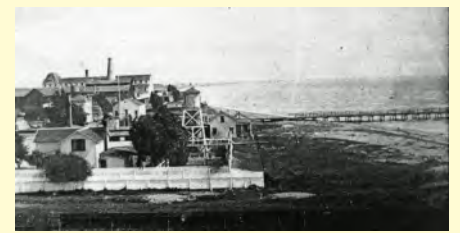
Standard Soap Co. and wharf, Addison St., Allston Way, 2nd St., and 3rd St., 1900